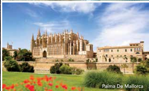
Palma De Mallorca