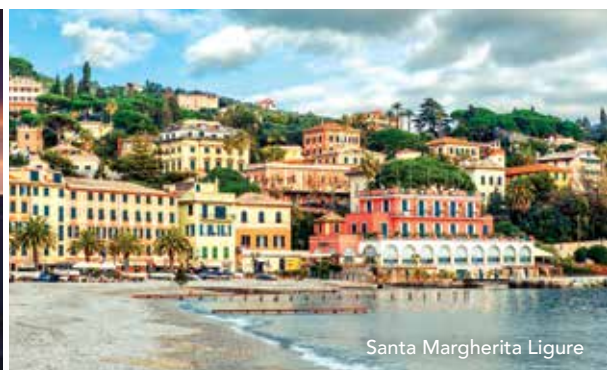
Santa Margherita Ligure