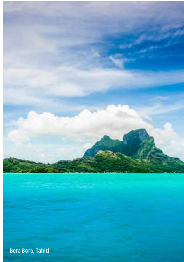
Bora Bora, Tahiti

35-Night Brisbane round trip 31-Night Sydney to Auckland Please contact Princess Cruises for fare details