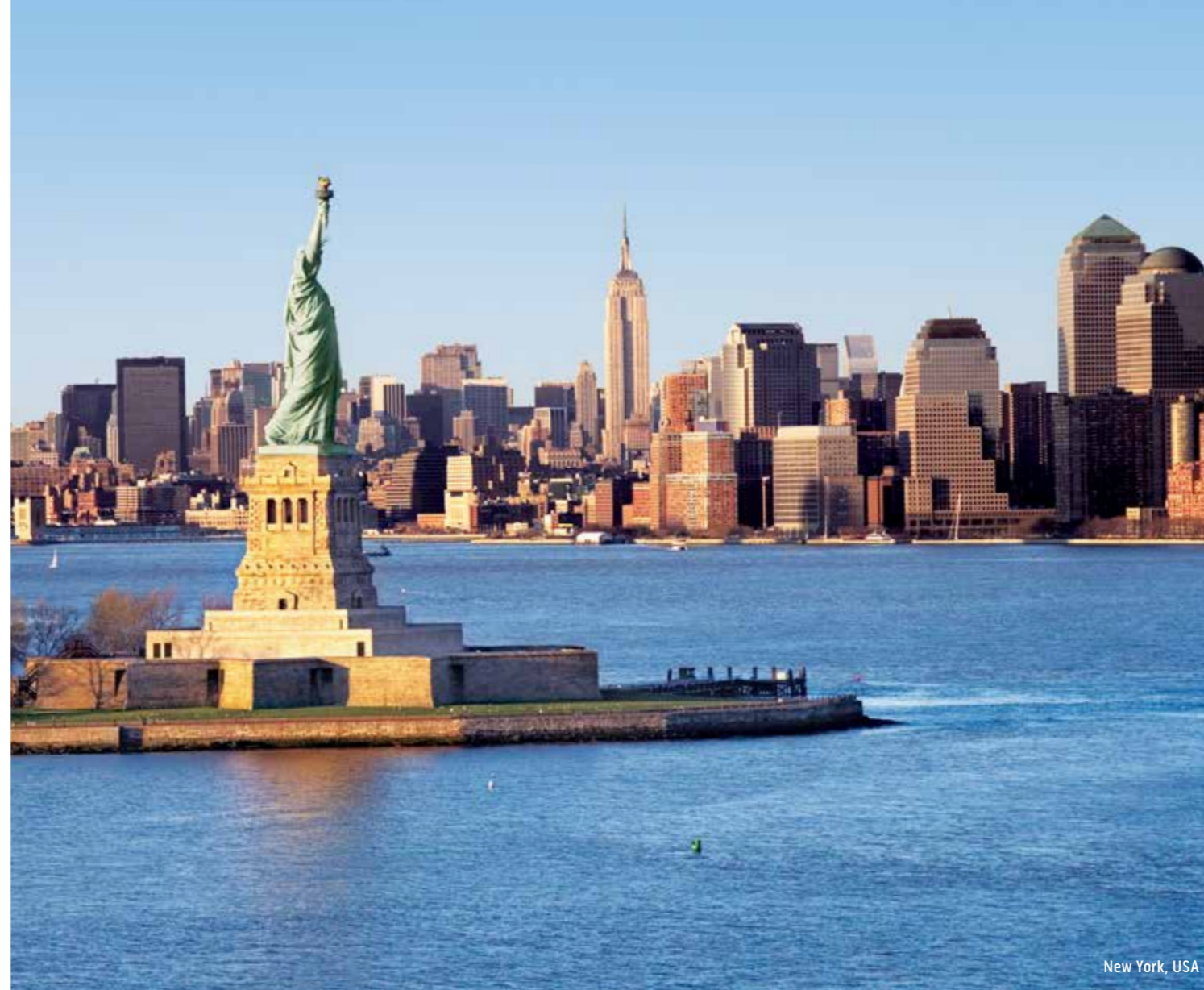
New York, USA

You'll come back renewed, refreshed with wonderful memories, and life won't seem quite so routine anymore.