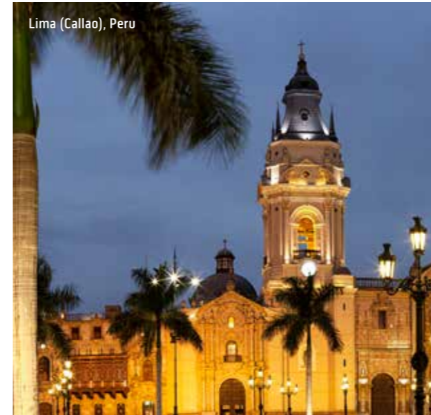
Lima (Callao), Peru

One of the best-preserved cities in South America, you will marvel at Quito's 16th and 17th century Baroque architecture. It is also the site of the first major religious structure built in the new world.