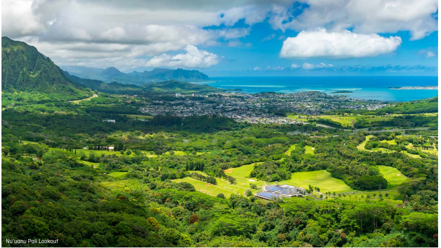
Nu'uuanu Pali Lookout