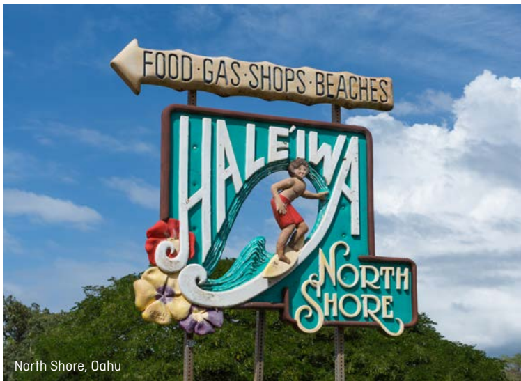
North Shore, Oahu