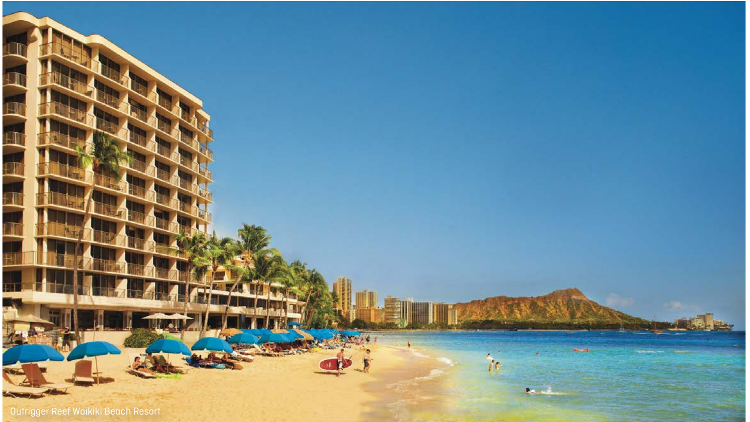
Outrigger Reef Waikiki Beach Resort