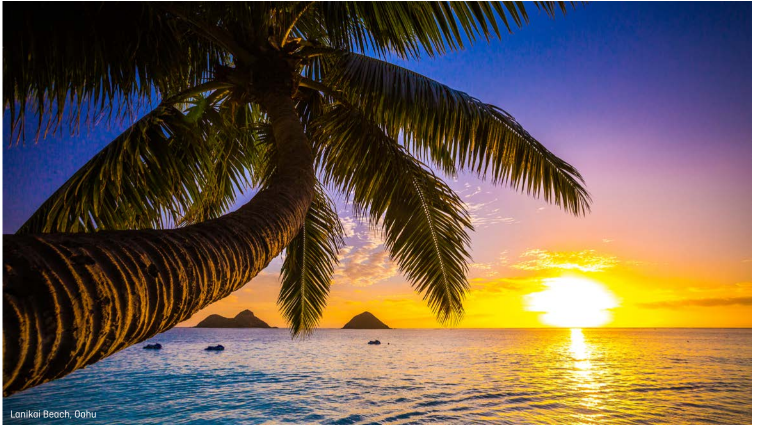
Lanikai Beach, Oahu