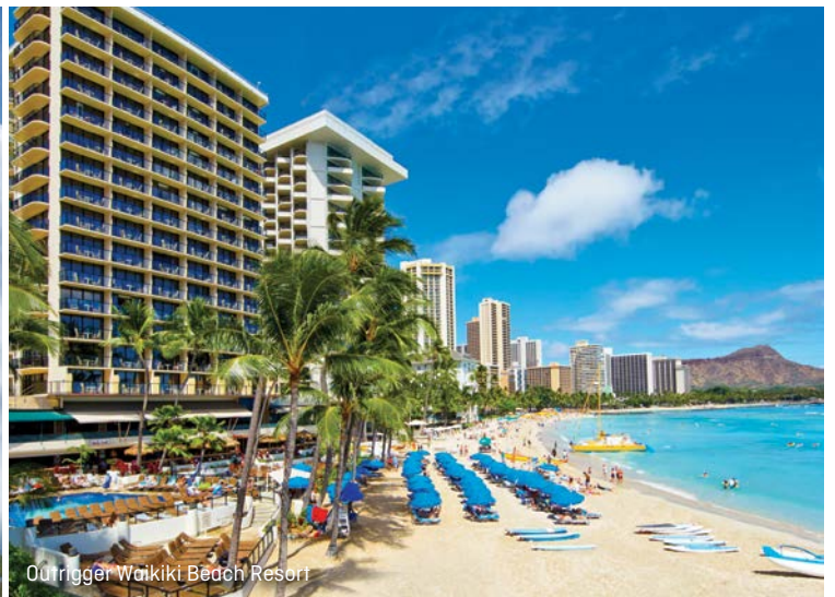
Outrigger Waikiki Beach Resort

Escape to the beautiful beaches of an island paradise like no other. Where the 'Aloha Spirit' will embrace you immediately and your days are spent lazing by the warm waters of the Pacific Ocean. Enjoy 8 days soaking in the sun, sand and surf that make Hawai'i famous.