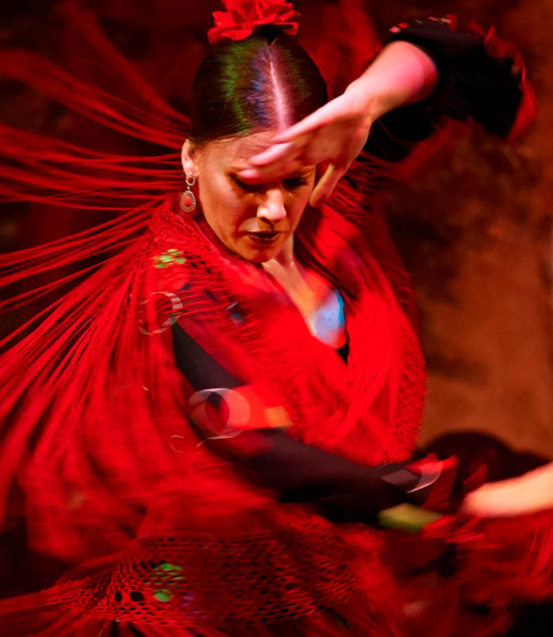
FLAMENCO DANCER, VIGO, SPAIN