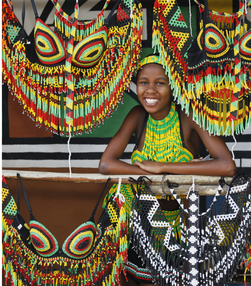
DURBAN, SOUTH AFRICA