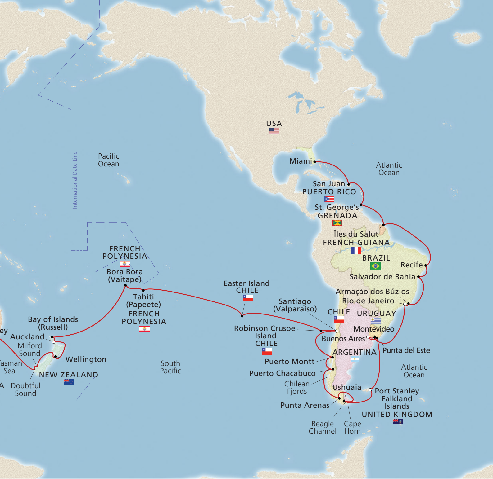
EASTER ISLAND, CHILE