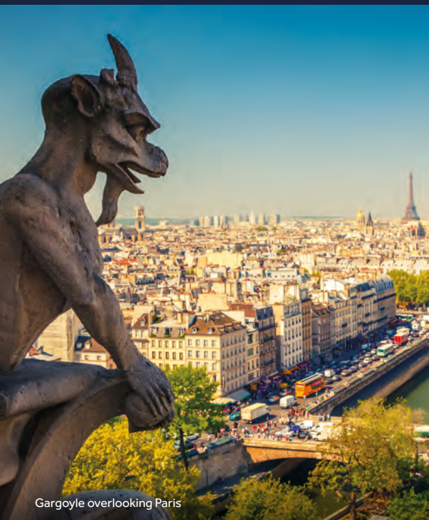
Gargoyle overlooking Paris