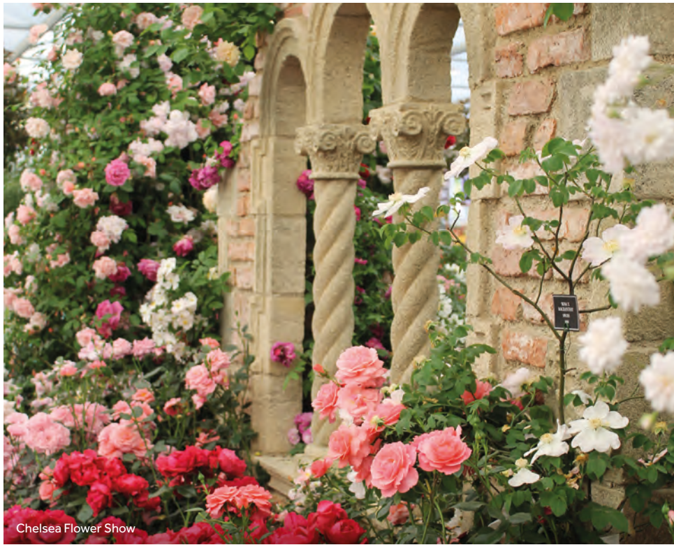
Chelsea Flower Show

Hall. Then explore Burg Square with its ornate Gothic town hall and glorious frescoes on the walls of the Holy Blood Chapel. Afterwards enjoy a relaxing canal cruise before dinner at a local restaurant. (B, DW)