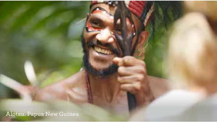
Alotau, Papua New Guinea

15-night Brisbane roundtrip departing 27 October