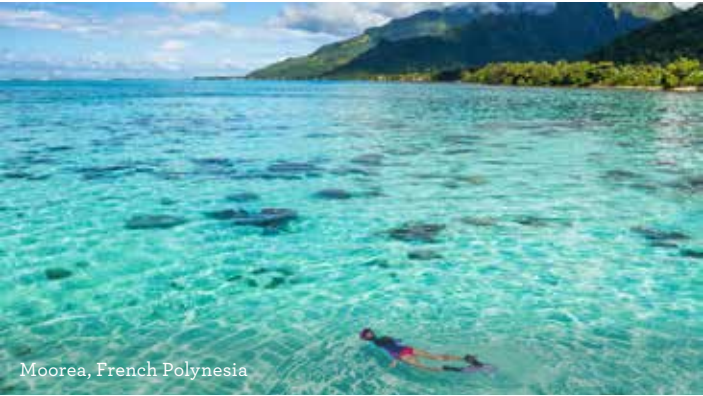
Moorea, French Polynesia

35-night Brisbane roundtrip departing 22 September