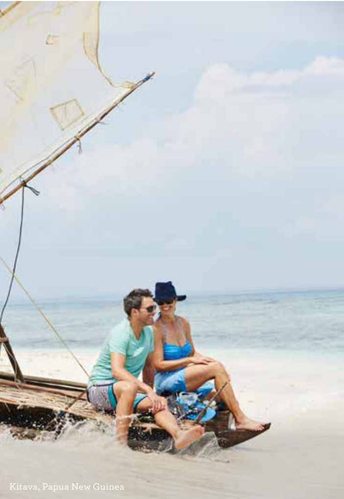
Kitava, Papua New Guinea