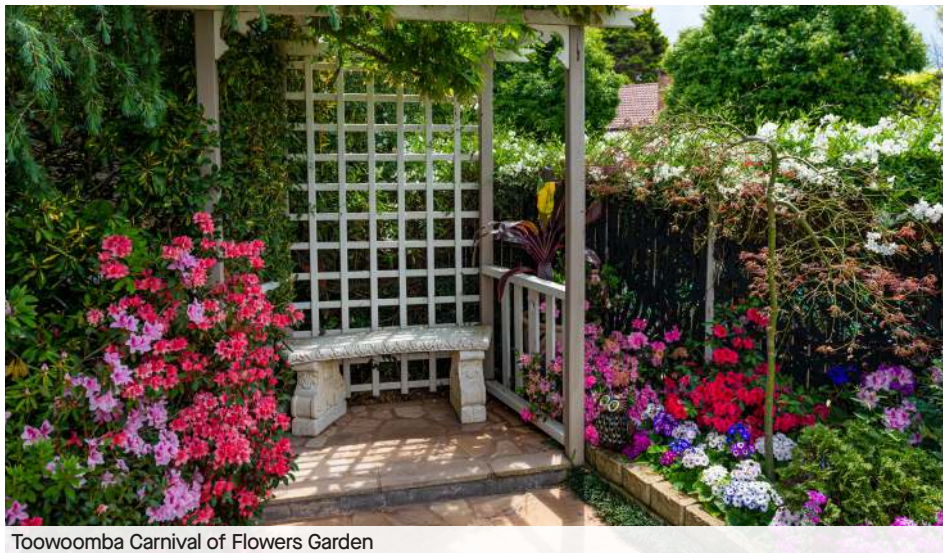
Toowoomba Carnival of Flowers Garden