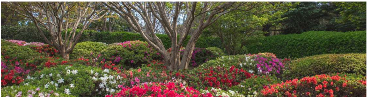
Ju Raku-en Garden