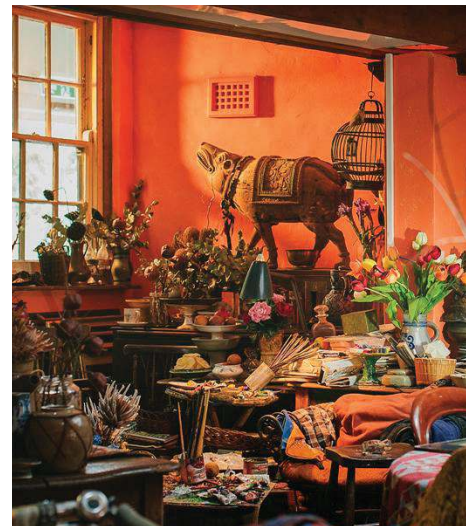
Margaret Olley Art Centre