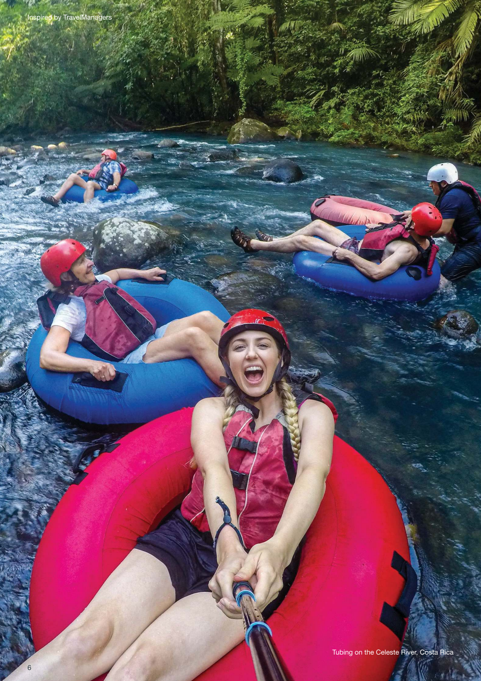
Tubing on the Celeste River, Costa Rica