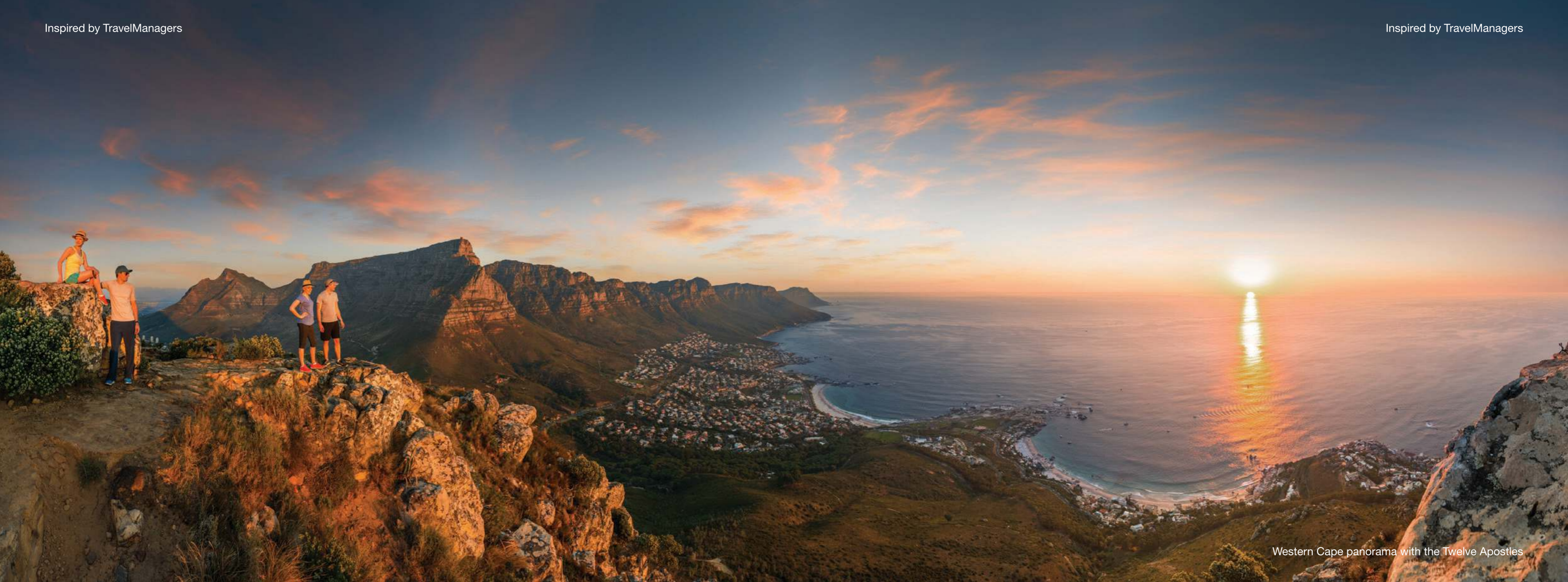
Western Cape panorama with the Twelve Apostles