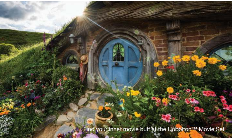
Find your inner movie buff at the Hobbiton™ Movie Set