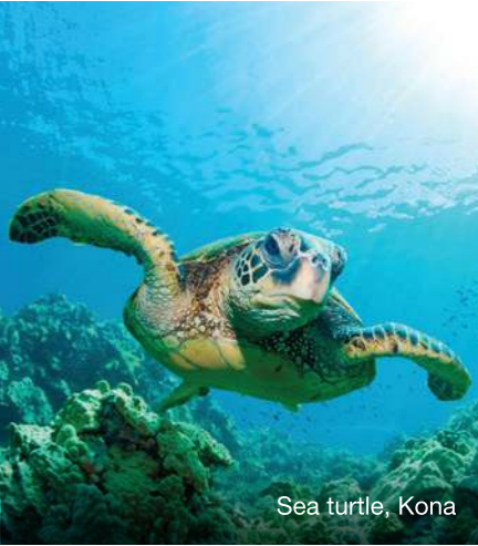
Sea turtle, Kona