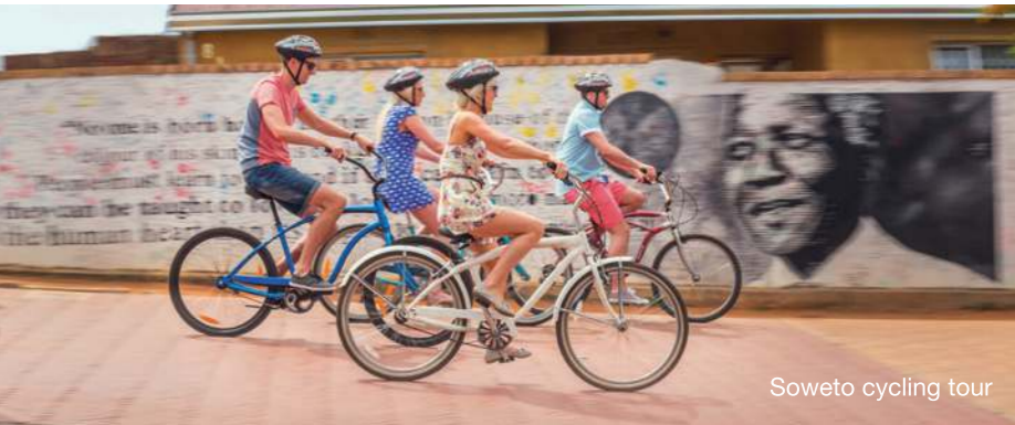
Soweto cycling tour

From luxury wine tours to adrenaline-filled safaris; from 3-course dinners with wine at $35AUD per head to unique culinary experiences, South Africa is a fantastic