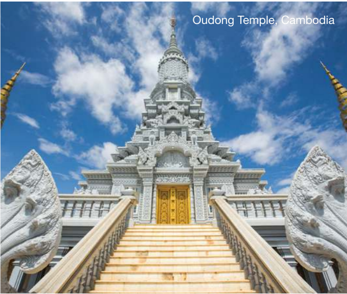
Oudong Temple, Cambodia

In Southeast Asia, water is life: a symbol of renewal and purification. The Mekong – meaning “mother of rivers” – is the spiritual and physical lifeline of the region. Meandering for 4,350 kilometres from Tibet to the South China Sea, the river supports more than 70 million inhabitants in six different countries – China, Myanmar, Laos, Thailand, Cambodia and Vietnam.