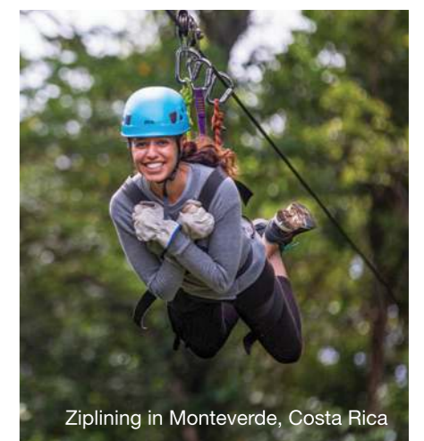
Ziplining in Monteverde, Costa Rica

For great deals on these and many more Intrepid adventures, visit travelmanagers.com.au/specialoffers or ask your personal travel manager for details.