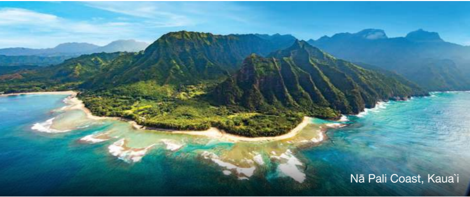
Nā Pali Coast, Kauaʻi

For NCL deals, visit travelmanagers.com.au/specialoffers or ask your personal travel manager for details.