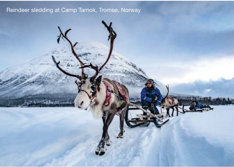
Reindeer sledding at Camp Tamok, Tromsø, Norway

With some of the happiest locals in the world and stunningly unique natural wonders, Norway is a picturesque winter escape sure to delight and inspire. For those in search of the more adventurous side of this Scandinavian gem, a journey along its long, fjord-studded coastline during the icy, dark winter months is a must. Northern Norway is one of the best places in the world for those hoping to witness the luminous Aurora Borealis dancing in the sky, but there are plenty of other rewarding escapades to enjoy during a winter cruise here as well.