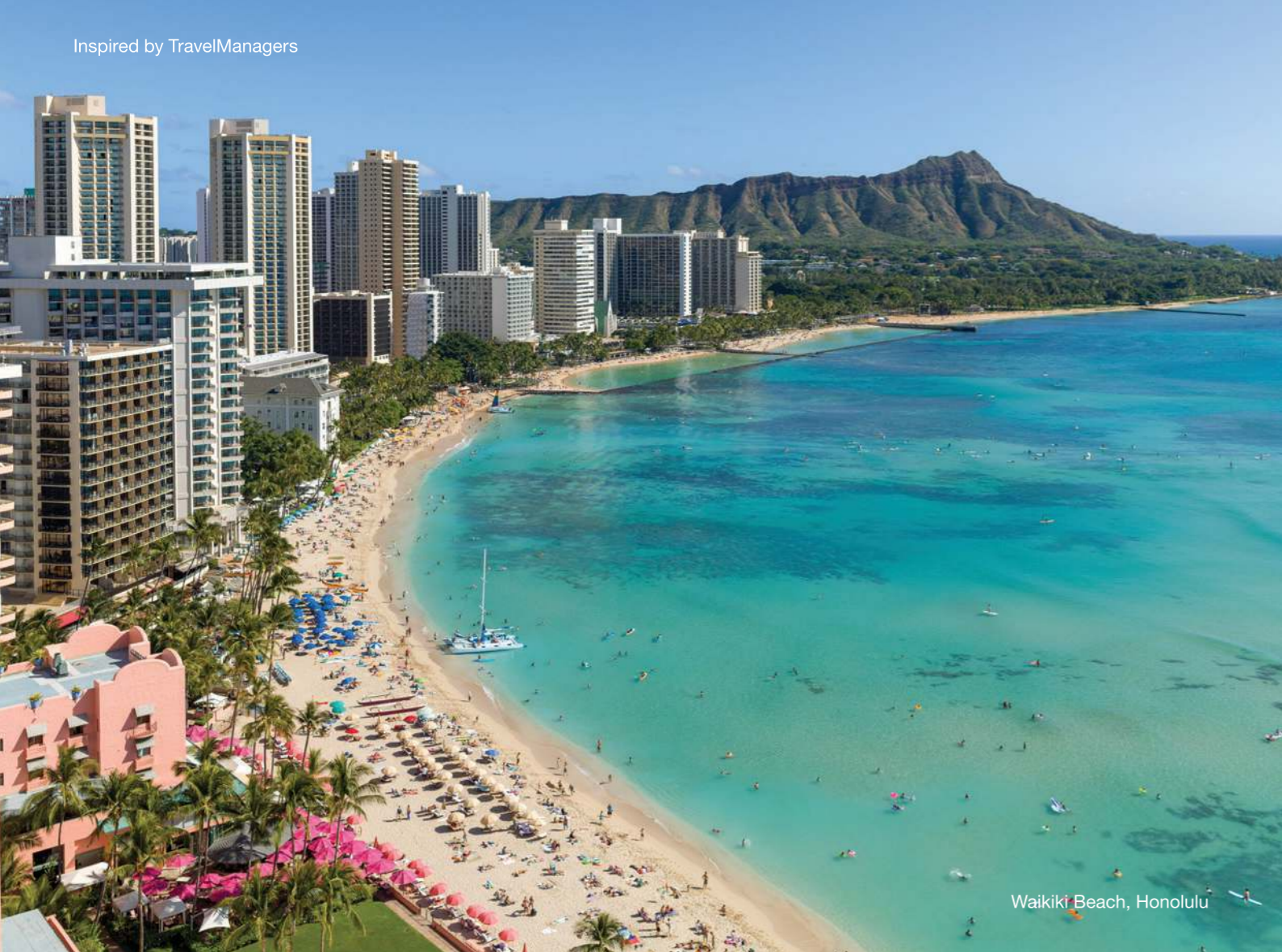
Waikiki Beach, Honolulu