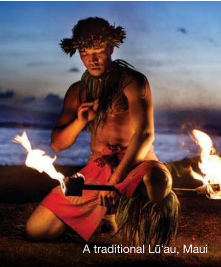
A traditional Lūʻau, Maui

The spirit and soul of Hawaiʻi can be felt as soon as you touch down in this island paradise. Cruise through the vibrant blue waters as you set out to explore the culture, sights and local flavours of its unique ports including Honolulu (Oʻahu), Kahului (Maui), Hilo (Big Island), Kona (Big Island) and Nāwiliwili (Kauaʻi).