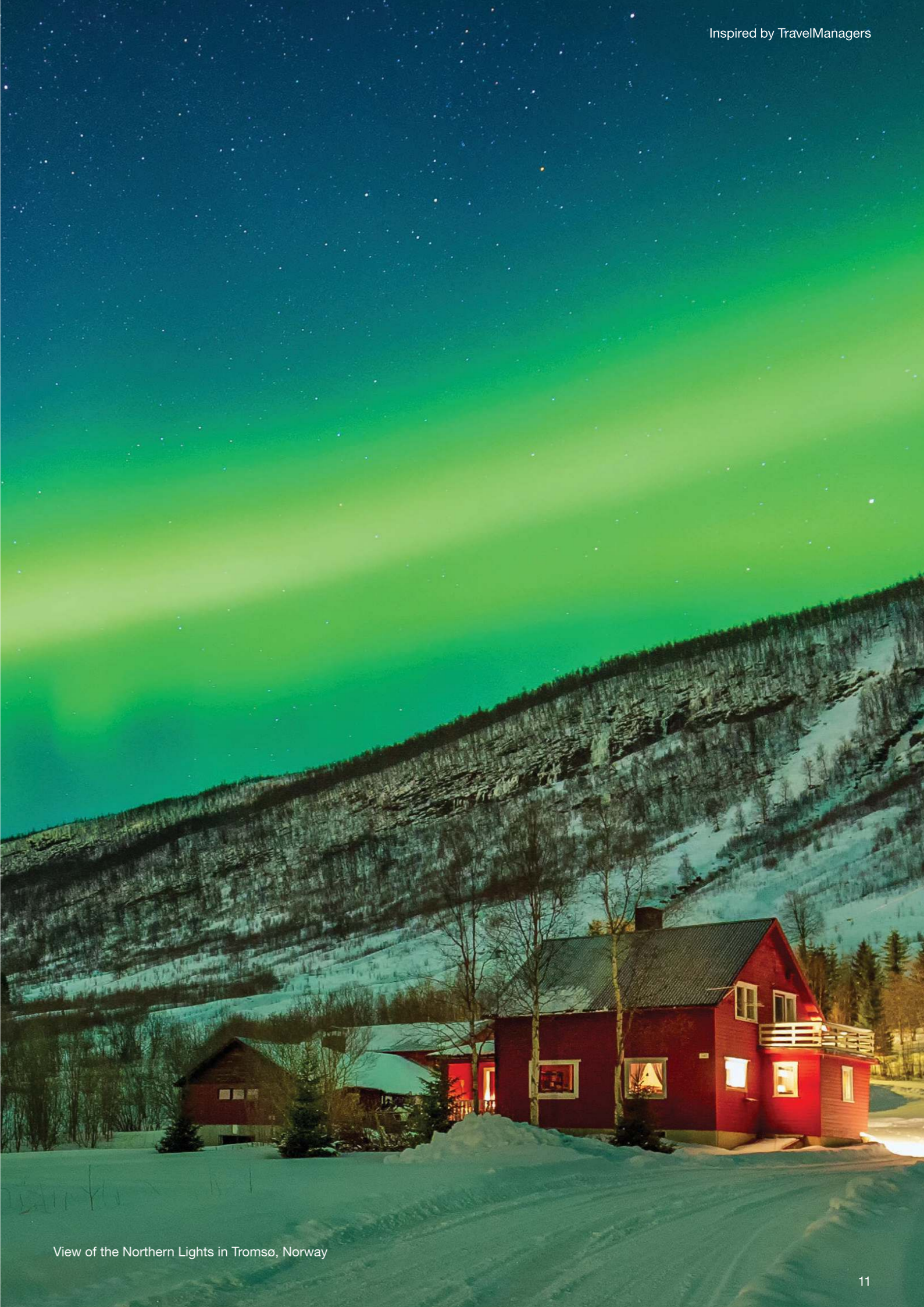
View of the Northern Lights in Tromsø, Norway