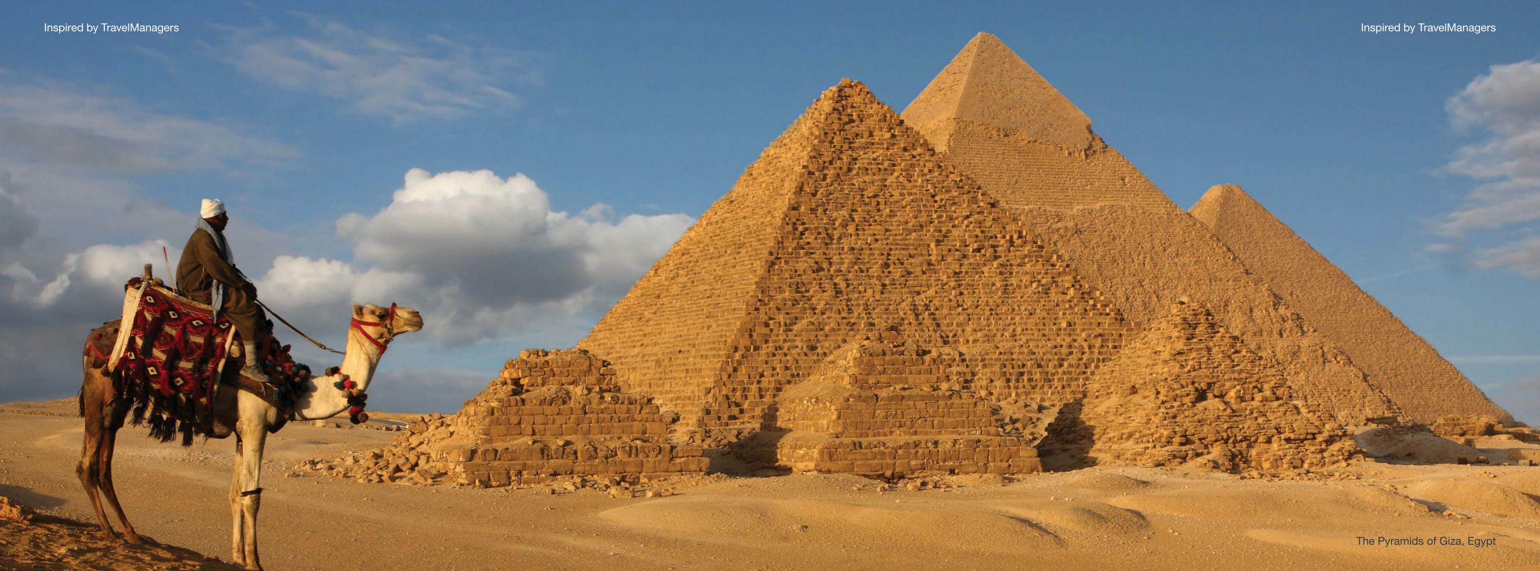
The Pyramids of Giza, Egypt