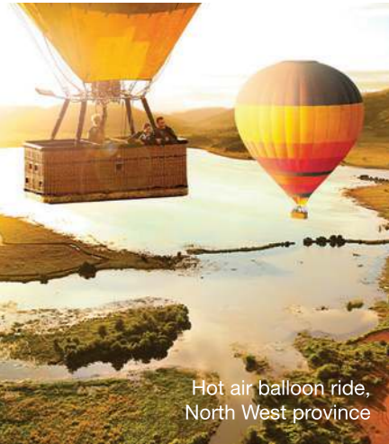
Hot air balloon ride, North West province

For the latest South Africa travel deals, visit travelmanagers.com.au/specialoffers or ask your personal travel manager for details.