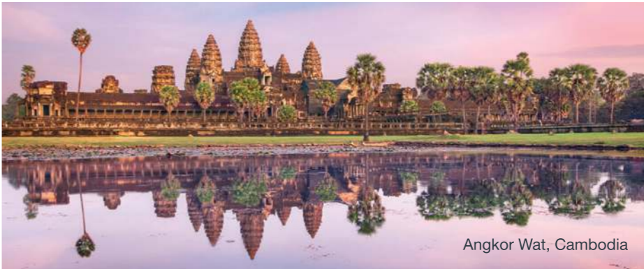
Angkor Wat, Cambodia

Make 2020 your year to experience the adventure and culture of Southeast Asia first-hand, on a Scenic five-star, all-inclusive, luxury river cruise. The boutique ships are designed to deliver the most indulgent, all-inclusive holiday, while introducing you to the diverse cultures, great food and, rich history and natural wonders of Vietnam. Complex and at times challenging, a visit to these tropical climes will enrich and intrigue, creating memories that will linger long after you have returned.