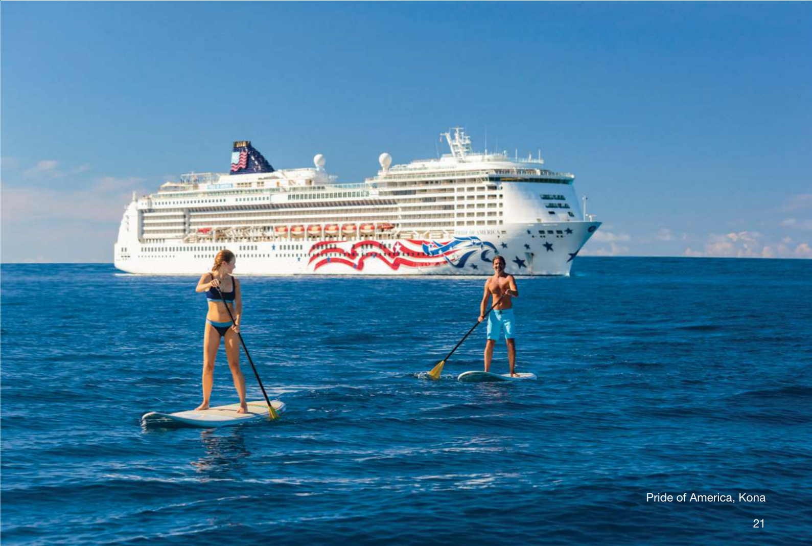
Pride of America, Kona