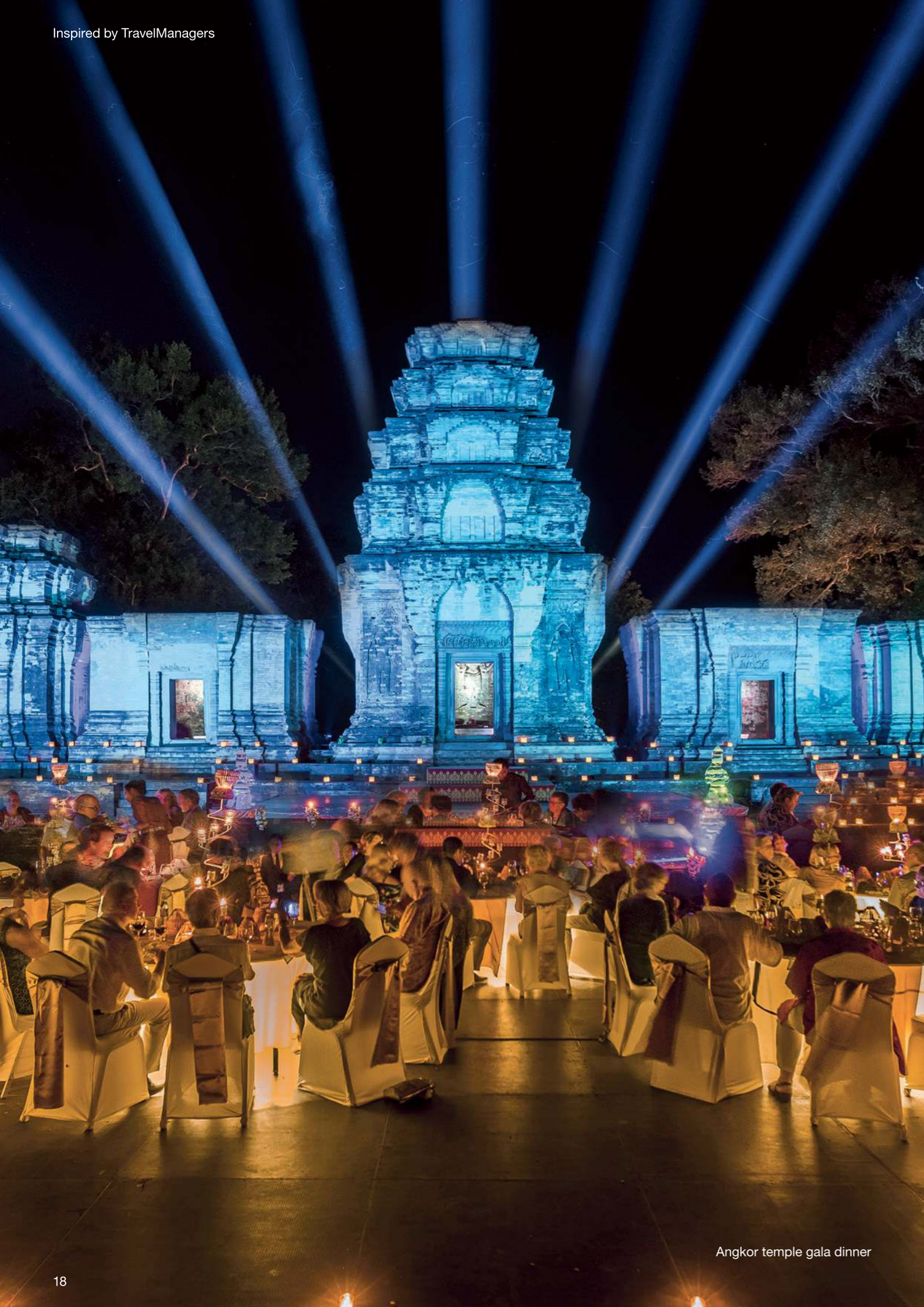
Angkor temple gala dinner